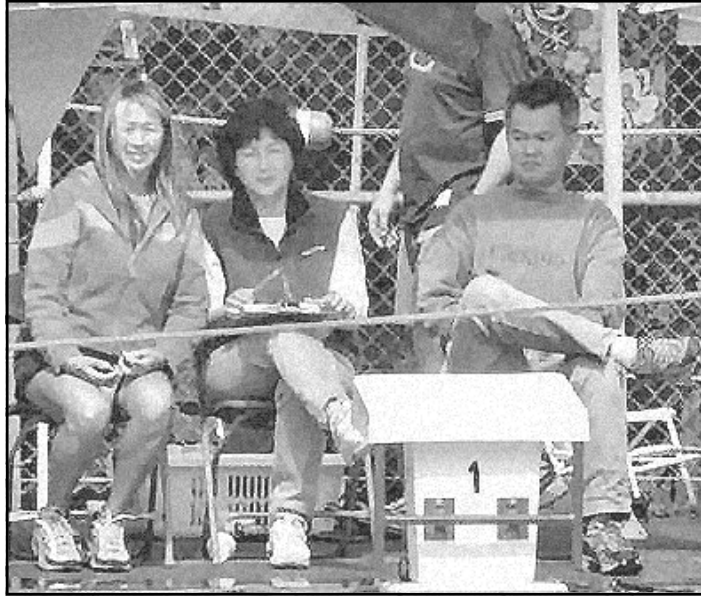
Volunteer Parents helping out on deck at a recent meet