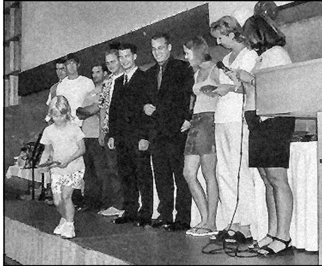
A Junior Prep swimmer receives her award from the Coaches at last years ABBAs

The ABBA's (3rd Annual Burnaby Barracudas Awards