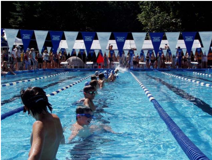
The human chain...